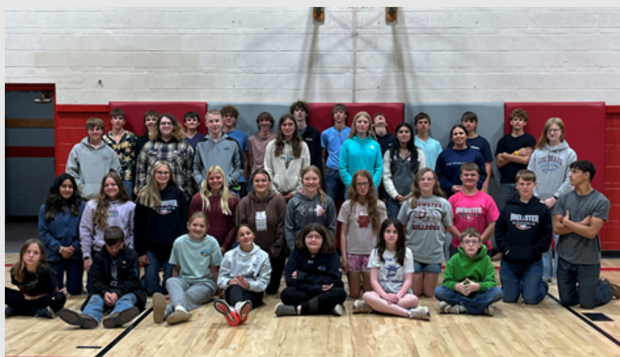
BREWSTER HIGH SCHOOL