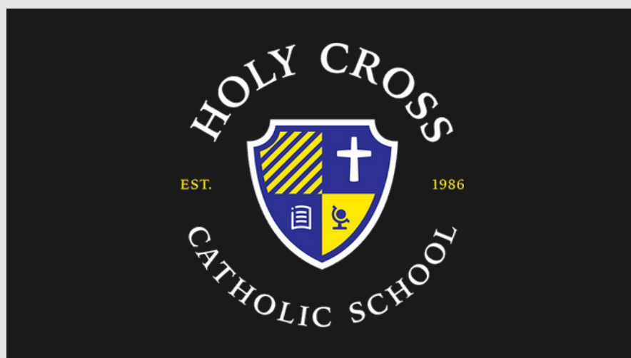
HOLY CROSS CATHOLIC SCHOOL