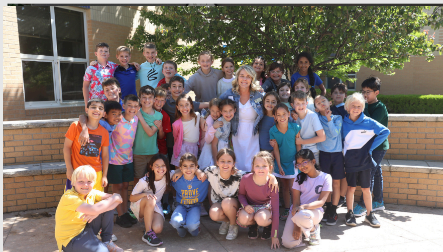
WICHITA COLLEGIATE SCHOOL